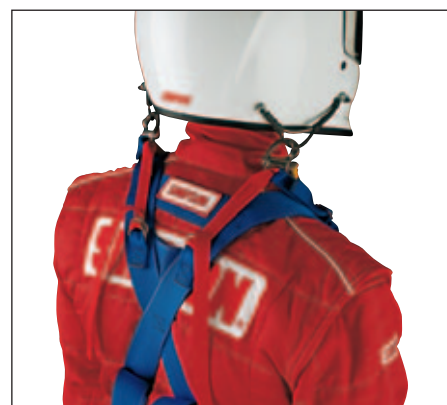
Head & Neck Restraint

Simpson World - Charlotte 185 Rolling Hills Road Mooresville, NC 28117 Tel: 704.662.3366